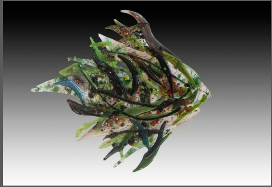
Forest floor pieces