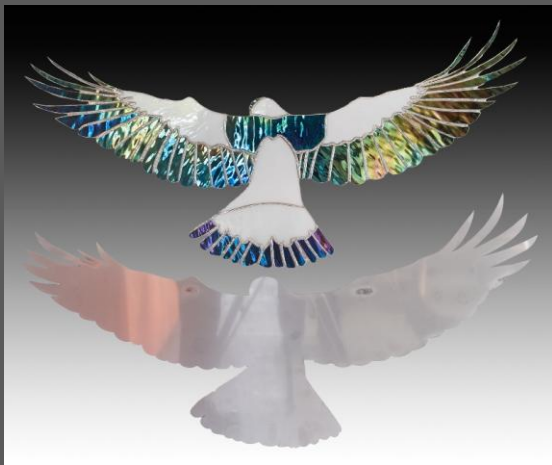
In the shadow of the magpie pieces